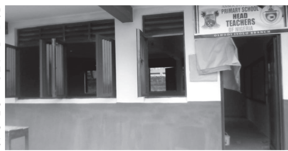
The commissioned Oshodi AOPSHON Secretariat

establish a Secretariat among the Lagos State AOPSHON chapters under the auspices of fifth Oshodi branch Chairman of